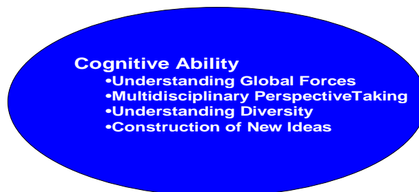
Figure 2. Summary of Cognitive Abilities