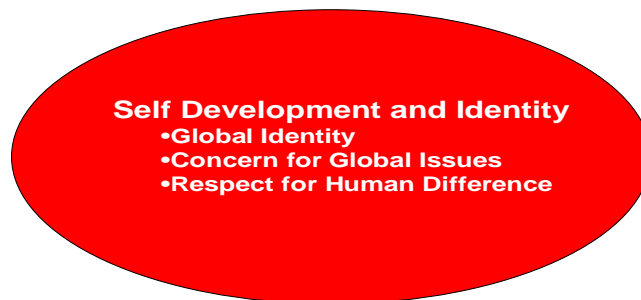
Figure 3. Self Development and Identity