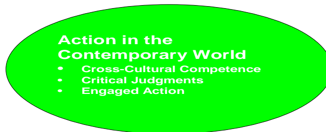
Figure 4. Action in the Contemporary World